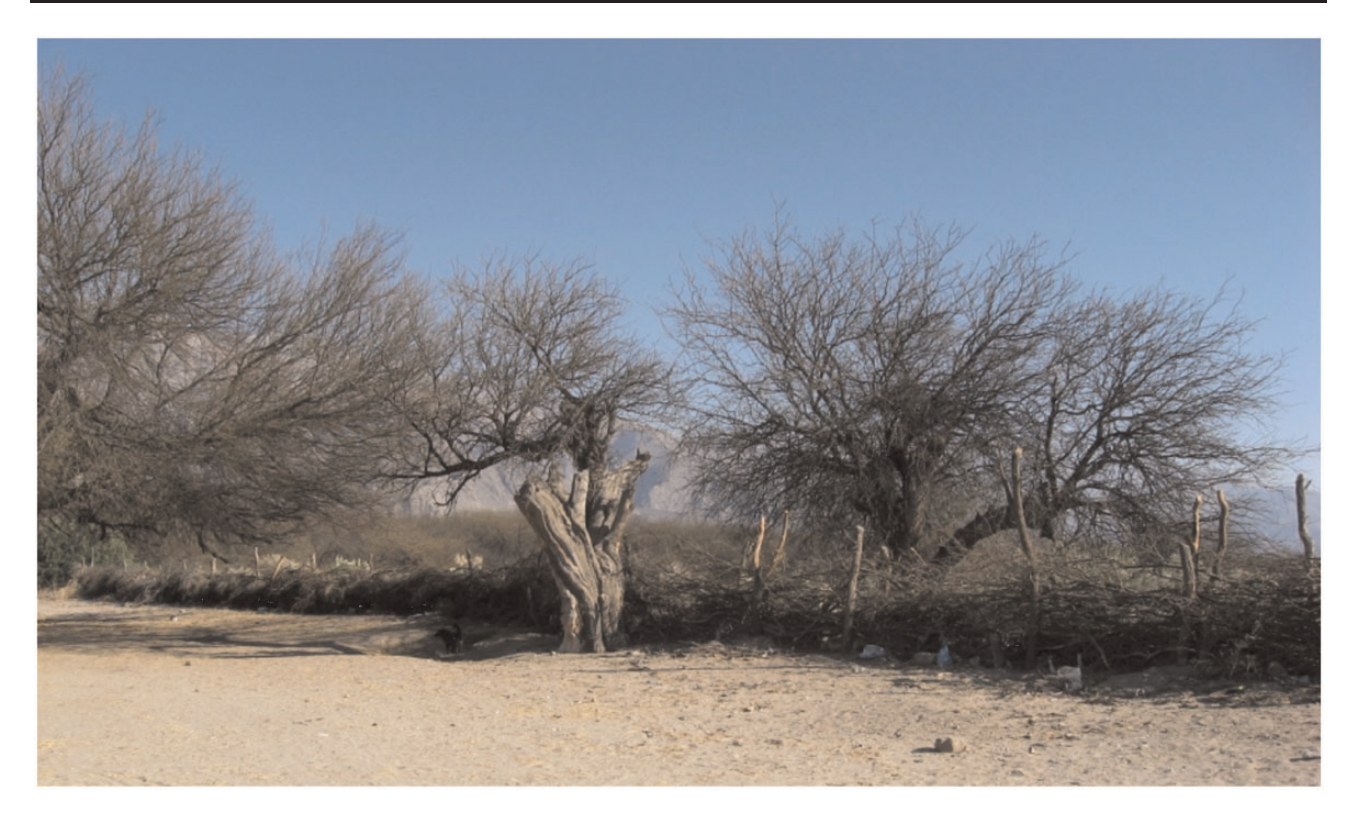
Fig. 2. Fence of dry shrubs harboring cavy colonies.