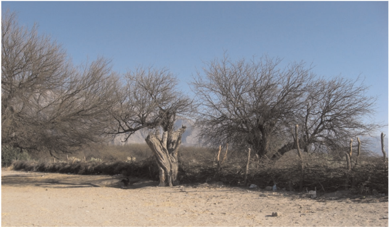
Fig. 2. Fence of dry shrubs harboring cavy colonies.